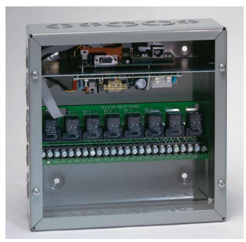
Industrial Power Switch